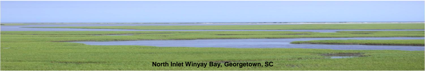
North Inlet Winyah Bay, Georgetown, SC

An educator workshop designed to capture the science of the salt marsh through photography, literature and the visual arts.